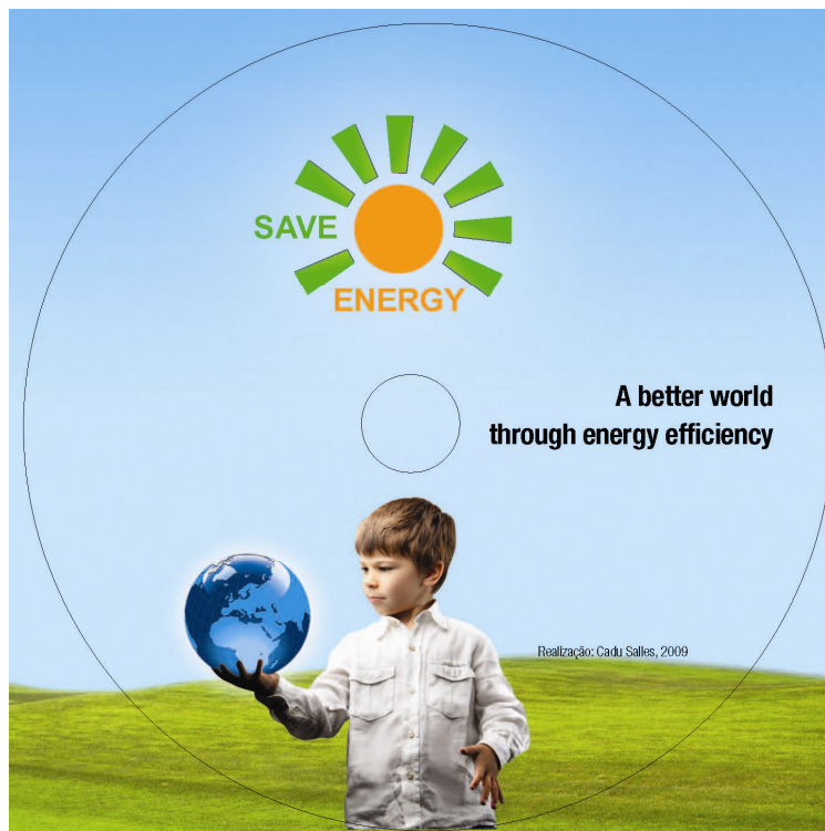
Figure 4 - DVD label