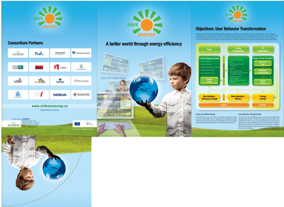
Figure 1 - Front and back cover