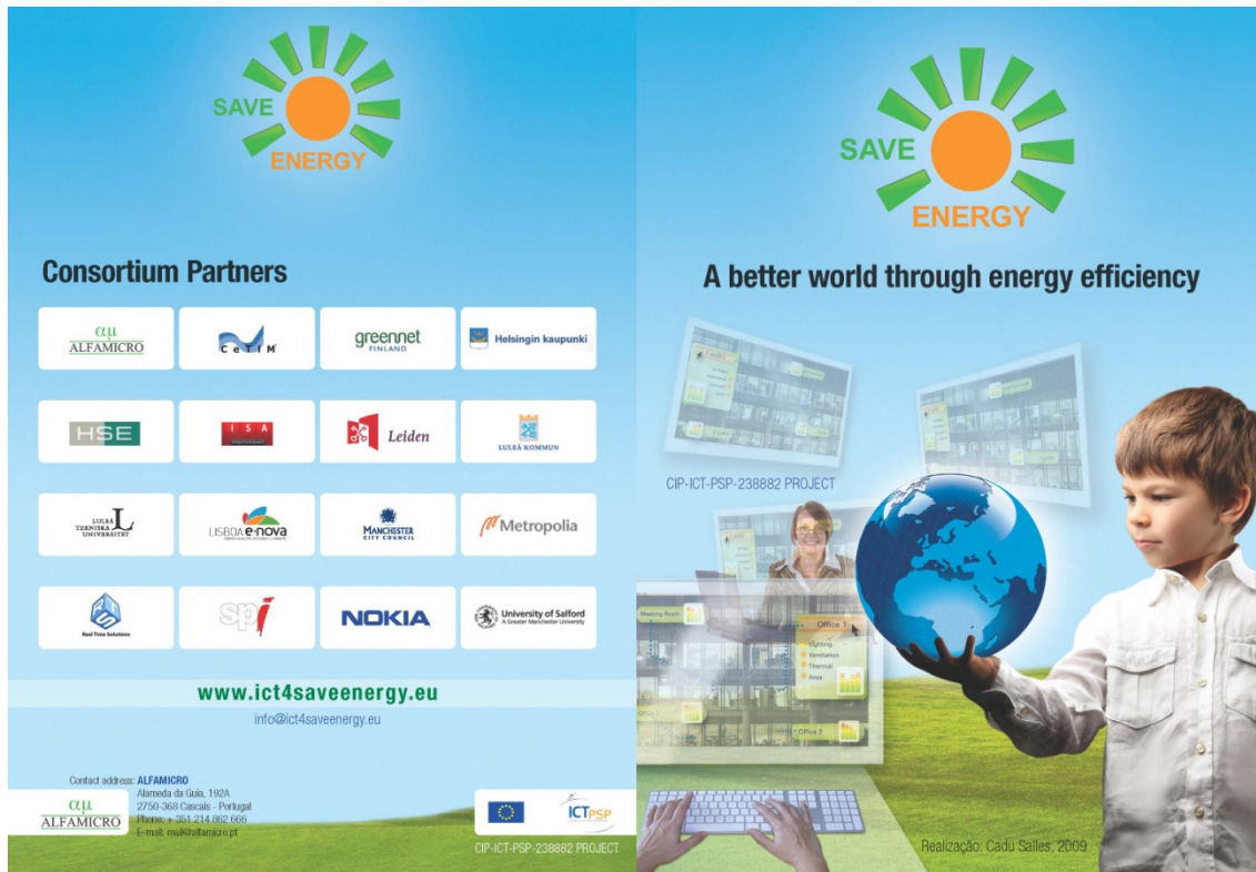
Figure 3 - DVD Cover